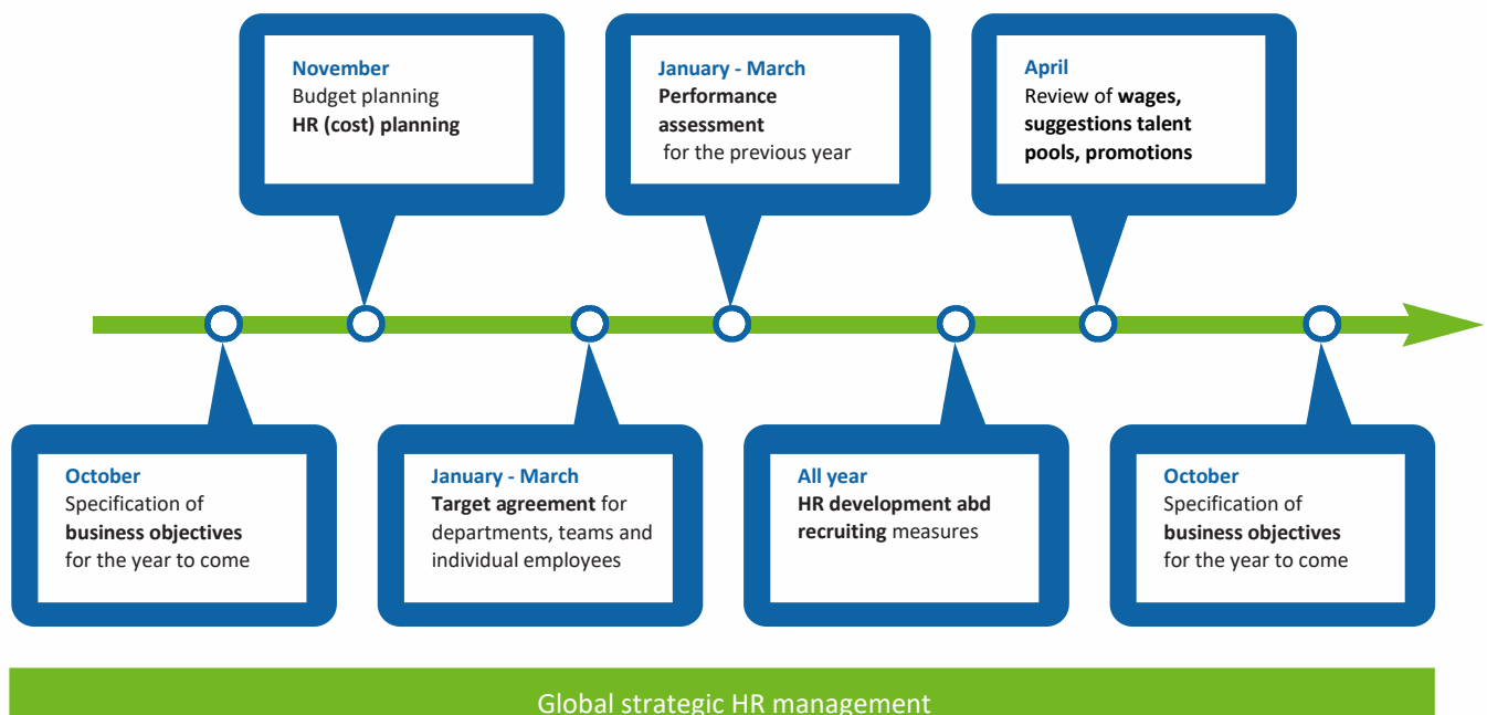
Graphic: Exemplary yearly HR planning and development

The works council can also use this schedule for its cooperation with the employer. The process clearly shows which information is available when and which decisions are made when. If not available, a collective HR development committee can be formed by representatives of the works council and the employer. This committee can come together and consult at important milestones- such as after assessment round to evaluate the results and to check the derived personnel development systems, or when talent pools need personnel, or also when workforce metrics are available and the new personnel planning is due.